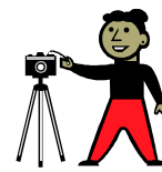
Photo Retakes have been scheduled for November 10th at 9:00 A.M. In order to ensure delivery of all portraits before Christmas, portrait packages will only be made for students who submit a Photo Order Envelope with payment to the photographer on photo day. There is no risk as all photos are fully guaranteed. If your child was absent for the original photos, or if you have chosen not to order from the first previews, please have your child obtain a Photo Order Envelope from the school office. The student will give the photographer your payment enclosed in the Order Envelope on photo day.