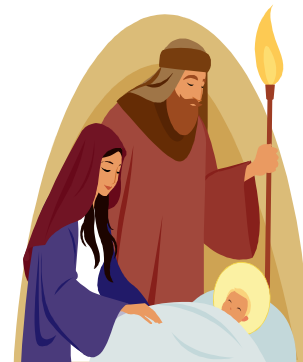
Wesofych Świąt Bożego Narodzenia

785 Patricia Boulevard Prince George, B.C. V2L 3V5 Telephone/Fax: (250) 563-5201 E-mail Address: shspg@netbistro.com Website Address: www.shspg.com