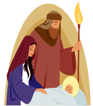
Wesofych Świąt Bożego Narodzenia

785 Patricia Boulevard Prince George, B.C. V2L 3V5 Telephone/Fax: (250) 563-5201 E-mail Address: shspg@netbistro.com Website Address: www.shspg.com